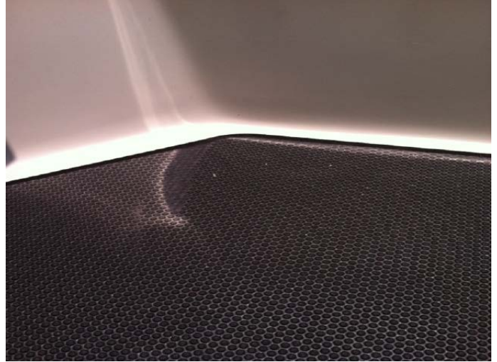
Reflection at certain angles.