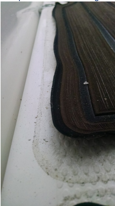
Example of extreme burning